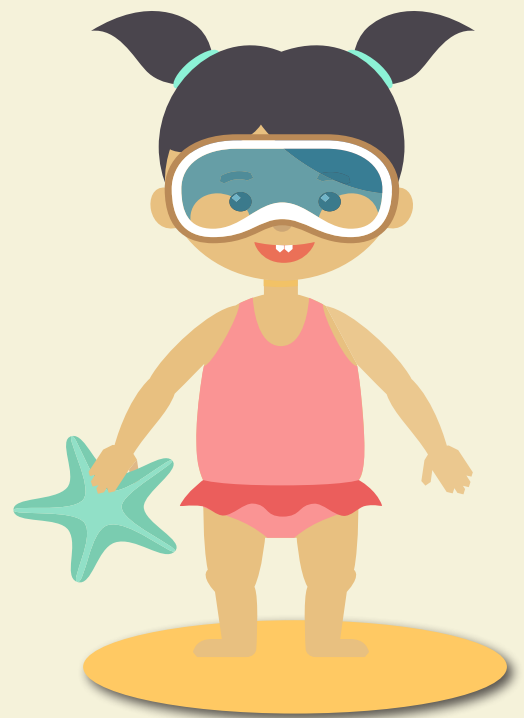
Figure out what I want to say, and put it into words for me.